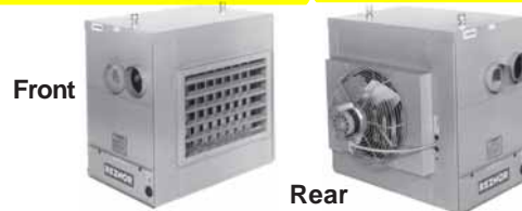
Model SCB Unit Heater (discontinued 2001)