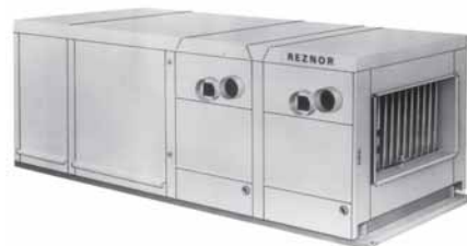
Model SSCDBL Packaged System with two "BL" Type Blower Cabinets and 2, 4, or 6 Furnace Sections (see paragraph on pg 3)